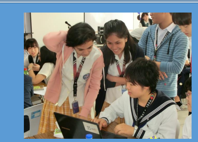
Future Leaders' Program for Global Peace